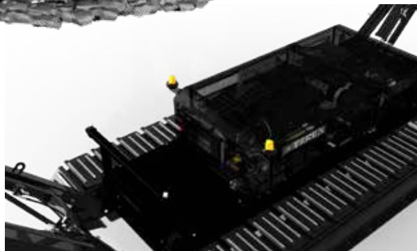
Deutz D2011 36.4kW(49hp) Engine