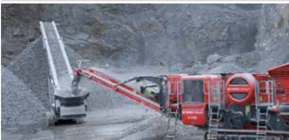
Full Length Conveyor Skirting