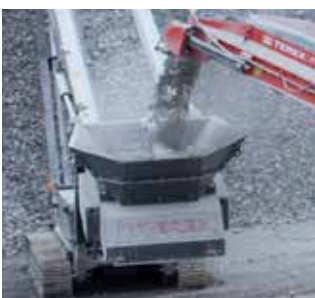
Feed Boot Liner Extension and Dust Covers