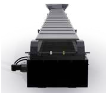
Head Drum Guards and Dust Covers