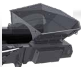
Feed Boot Extension